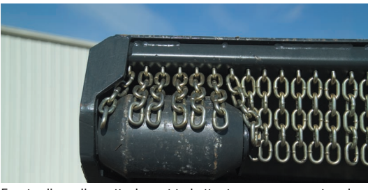
Front rollers allow attachment to better traverse uneven terrain while reducing operator fatigue. Standard equipment on all Brushcat rotary cutters.

The Bobcat Attachments Advantage: Bobcat attachments are engineered and manufactured to fit Bobcat loaders for optimum job performance, dependability and durability.